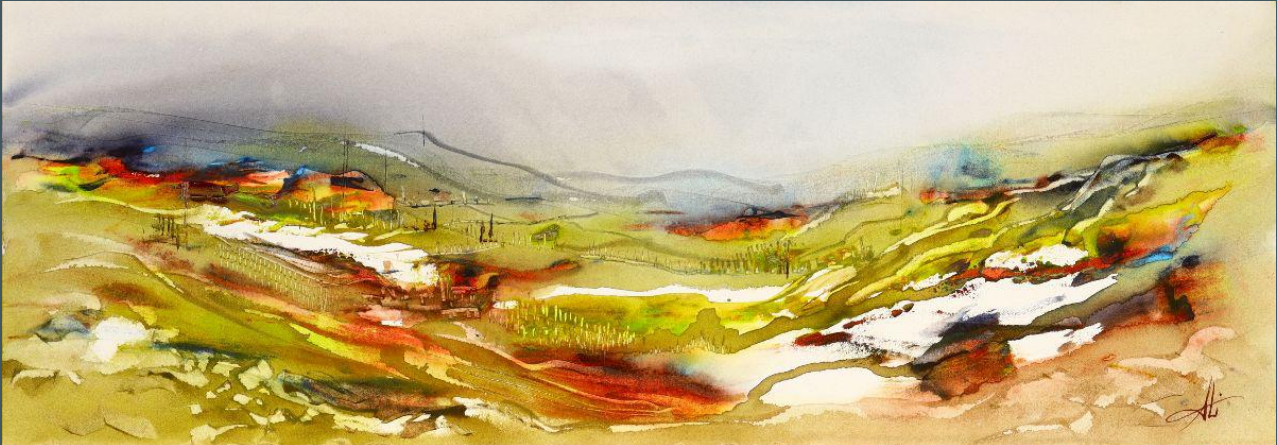
Horizon 8 - 50x17 cm