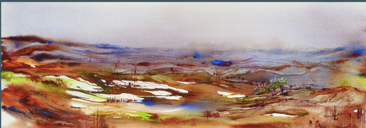
Horizon 9 - 50x17 cm